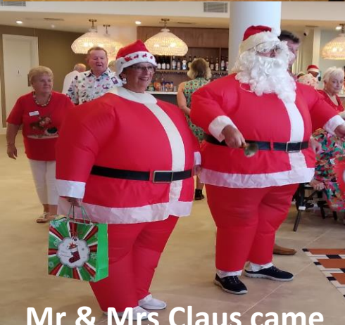
Mr & Mrs Claus came