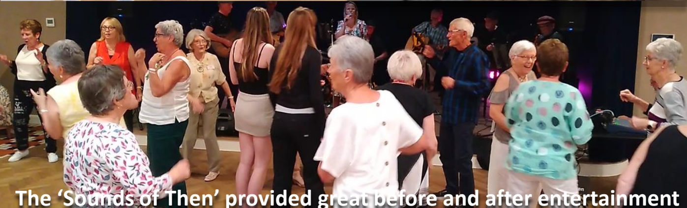
The 'Sounds of Then' provided great before and after entertainment