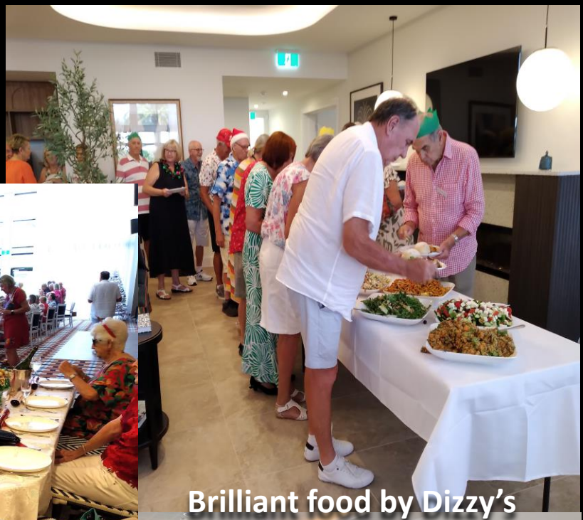
Brilliant food by Dizzy's Spit Roast