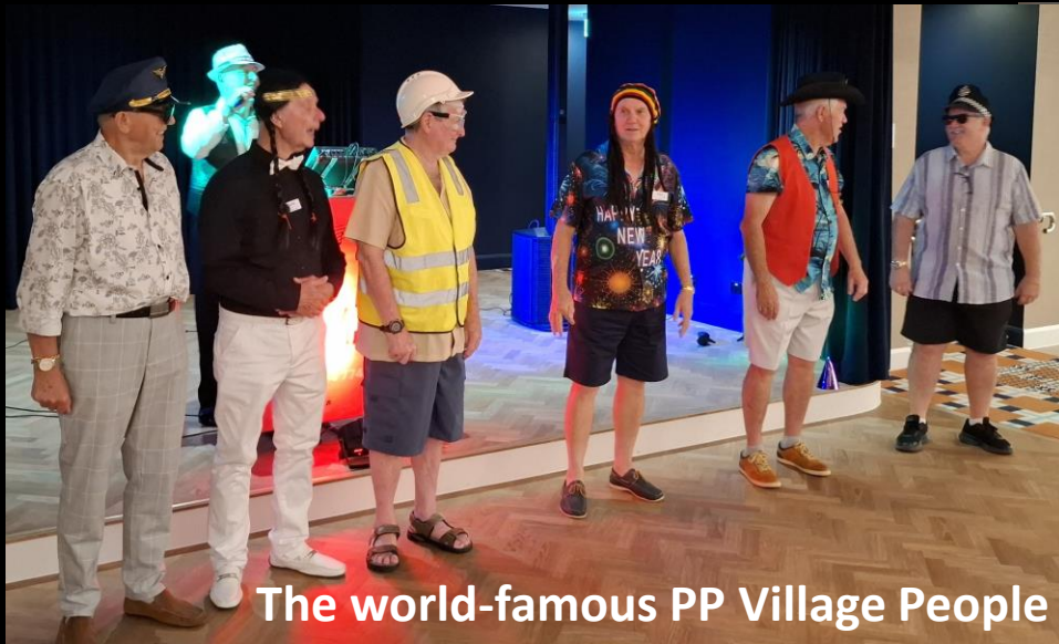
The world-famous PP Village People