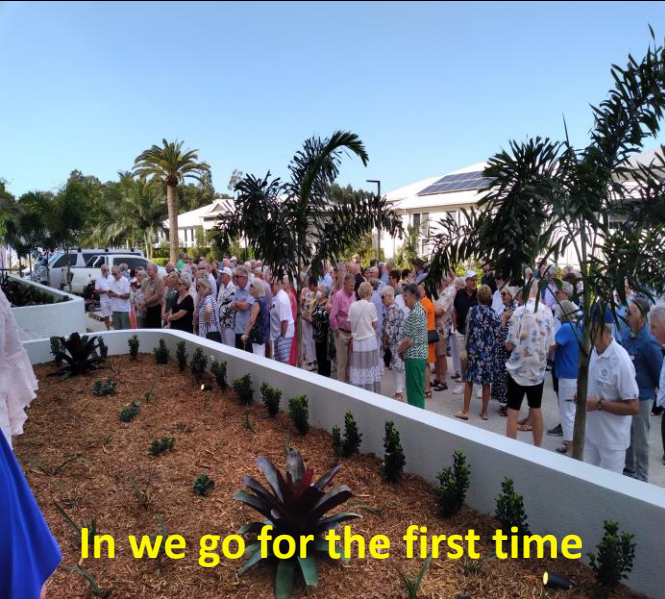
In we go for the first time