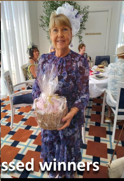
Our best dressed winners