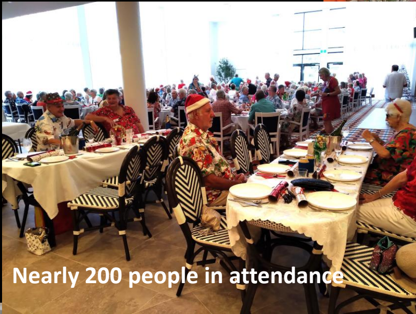
Nearly 200 people in attendance