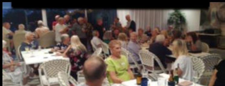
Early Happy Hours in the Pavilion

Free Villa Draw on Friday evenings, be there to win the Jackpot