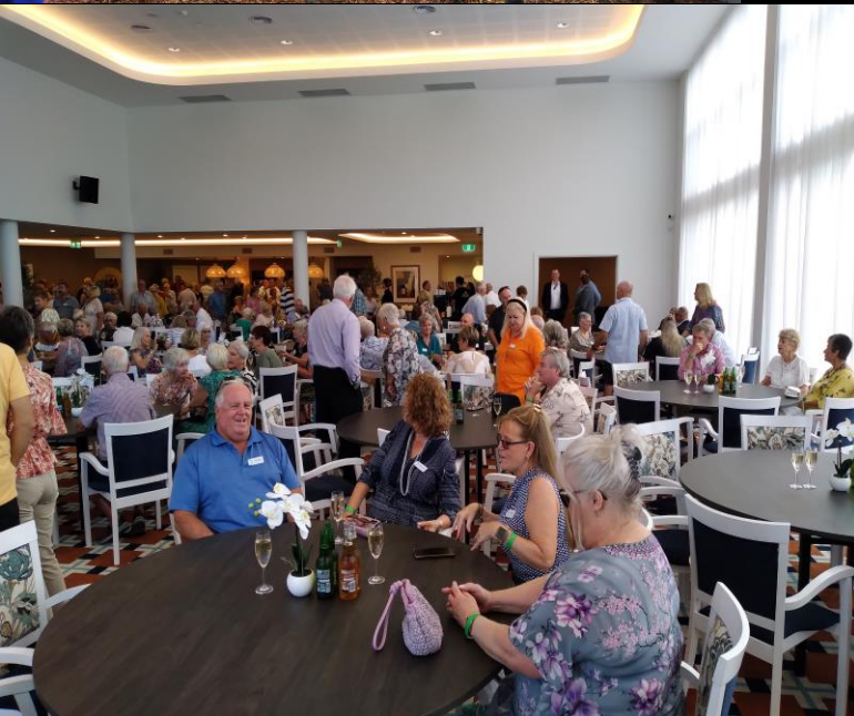
Thanks to GemLife for the food