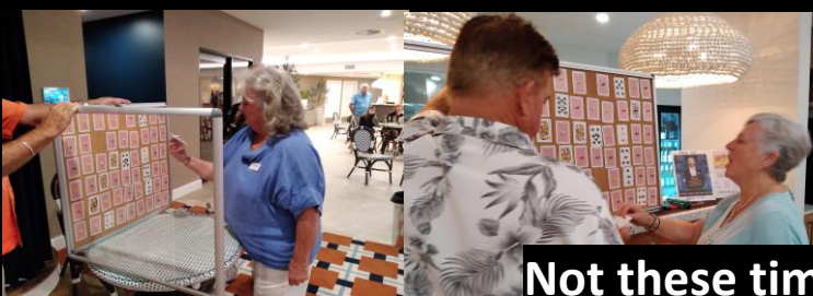
Not these times but.....