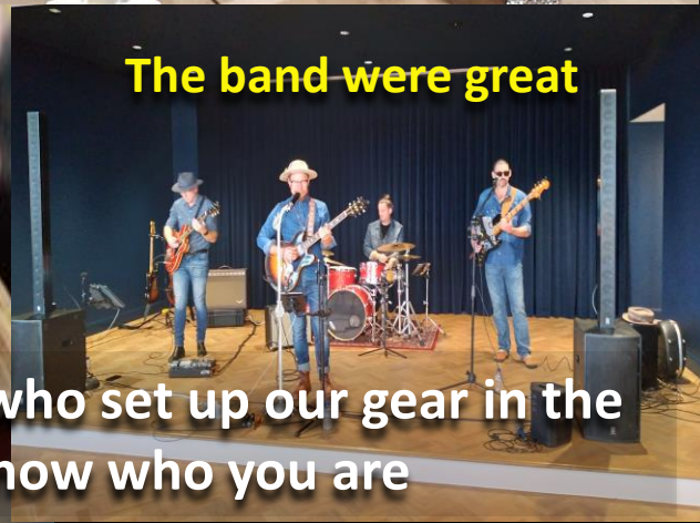
The band were great