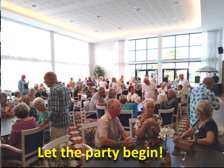
Let the party begin!