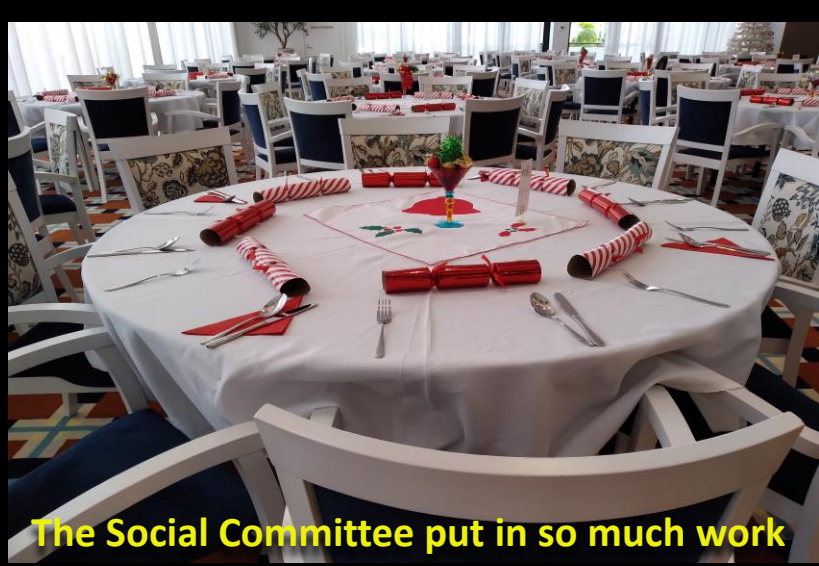
The Social Committee put in so much work