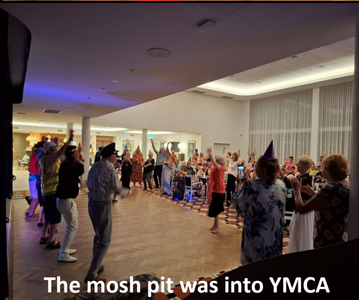
The mosh pit was into YMCA

Thanks to the guys for being such good sports